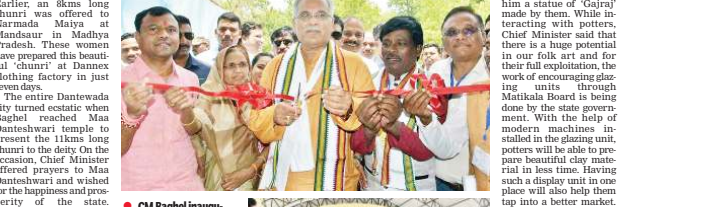
Chief Minister Bhupesh Baghel inaugurated and laid the foundation stone for 504 development works in Village Baidolepalle.