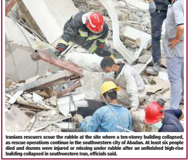
Tranians rescuers scour the rubble at the site where a ten-storey building collapsed, as rescue operations continue in the southwestern city of Abadan. At least six people were killed and dozens were injured or missing after an unfinished high-rise building collapsed in southwestern Iran, officials said.