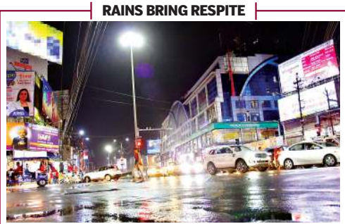
Light rains in the evening brought much required relief from scorching heat here on Tuesday evening.

RDA to launch eviction drive in Bombay Market premises. Raipur, May 24: Raipur RDA will launch an eviction drive in Bombay Market premises. The RDA will launch an eviction drive in Bombay Market premises. The RDA will launch an eviction drive in Bombay Market premises. The RDA will launch an eviction drive in Bombay Market premises. The RDA will launch an eviction drive in Bombay Market premises.