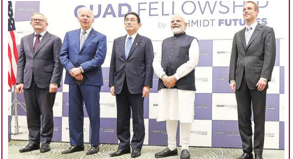
Prime Minister Narendra Modi, Prime Minister of Japan Fumio Kishida, U.S. President Joe Biden and Australian Prime Minister Anthony Albanese launch the Quad Fellowship, during the Quad Leaders' Summit at Kantei Palace, in Tokyo, Tuesday.