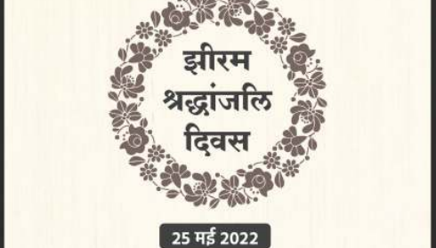
25 मई 2022

Terms of payment of insurance claims to farmers. Raipur, May 24: Chief Minister Bhupesh Baghel announced the terms of payment of insurance claims to farmers. Chief Minister Bhupesh Baghel announced the terms of payment of insurance claims to farmers. Chief Minister Bhupesh Baghel announced the terms of payment of insurance claims to farmers.