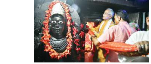
Chief Minister Shri. Nara Chandrababu Naidu offered 11kms long 'churni' to Maa Danteshwari temple to offer 'churni' to the deity.