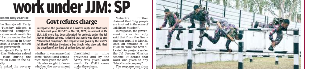
NCC cadets perform a routine drill during their annual Army Training Camp, at Nagrota on the outskirts of Jammu, Tuesday.