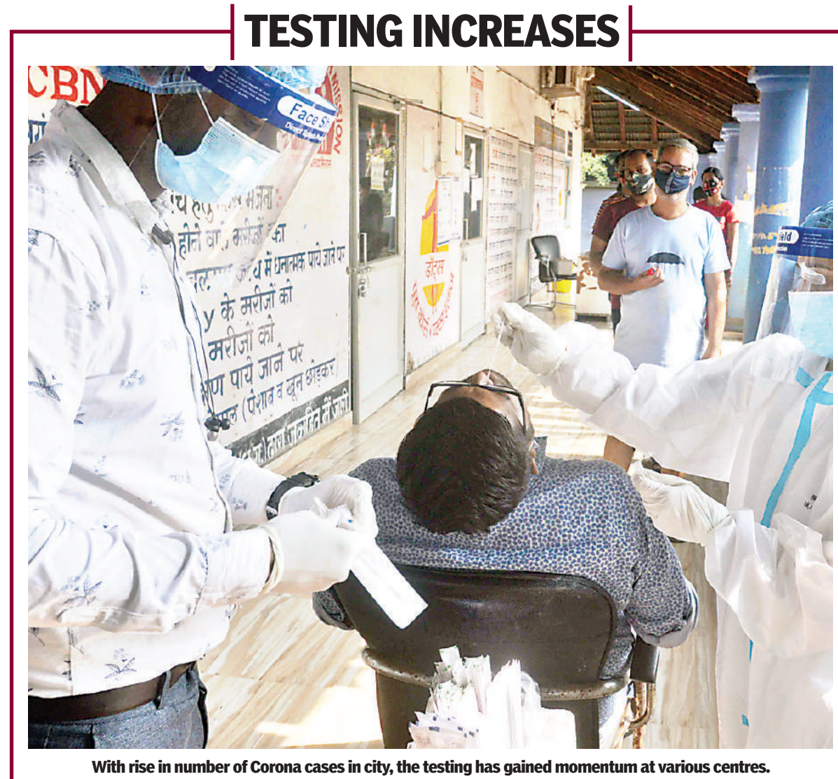
With rise in number of Corona cases in city, the testing has gained momentum at various centres.

Raipur, Jan 02: Chhattisgarh recorded over 100 COVID-19 cases for the third consecutive day on Friday, with the overall tally in the state reaching 10,08,187 after 190 people were detected with the infection, an official said. The death toll remained unchanged at 13,600, while the recovery count increased to 9,93,818 after seven people were discharged from hospitals and 11 completed home isolation, leaving the state