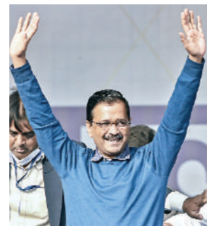
Delhi Chief Minister Arvind Kejriwal waves towards supporters during Kejriwal Ki Maharally in Lucknow, Sunday.

"Active COVID-19 cases rose from about 2,000 on December 29, 2021 to 6,000