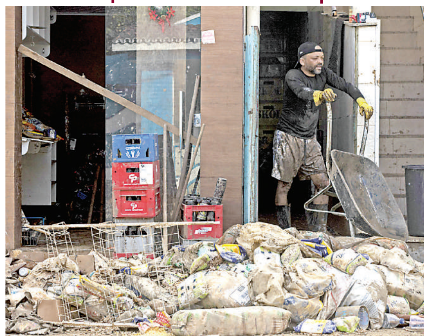
A man clears damaged or destroyed goods from a store after a flood caused by heavy rainfall in Jiquirica, Bahia State, Brazil.