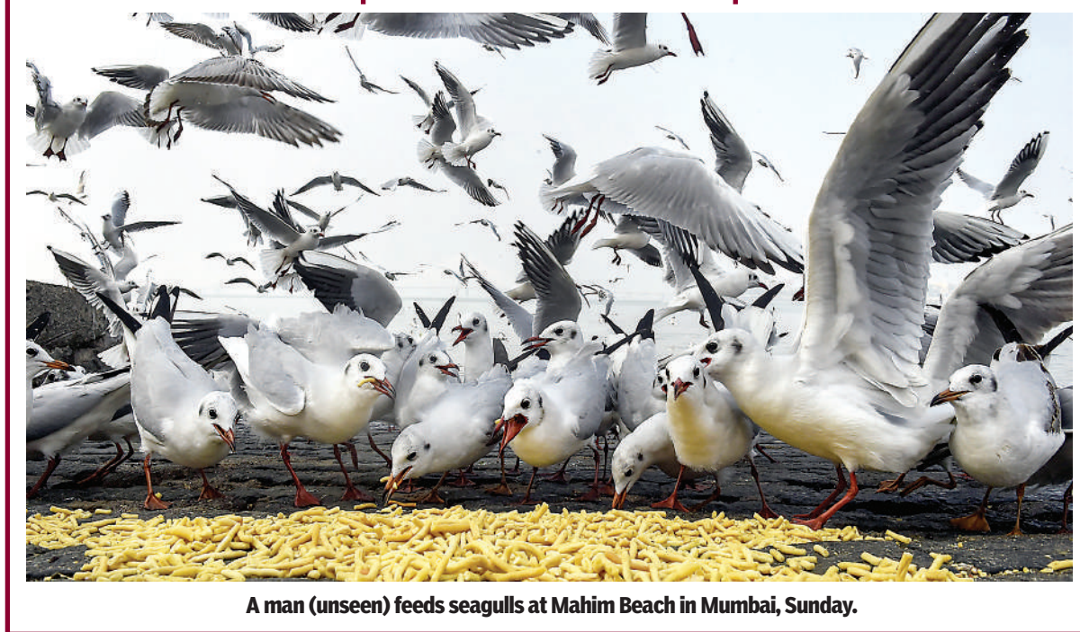
A man (unseen) feeds seagulls at Mahim Beach in Mumbai, Sunday.