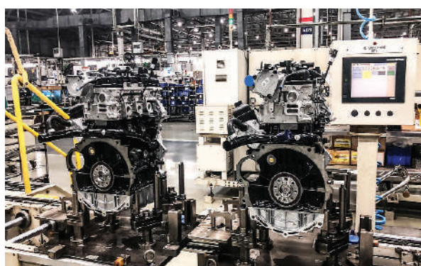
Hyundai plant in Chennai.

The auto major has led the sports utility vehicle (SUV) space in the country for two consecutive years now (2020 and 2021) and now expects to dominate the segment in 2022 as well. The company sold 1.8 lakh SUVs in 2020 and has closed 2021 with a dispatch of 2.52 lakh units. The