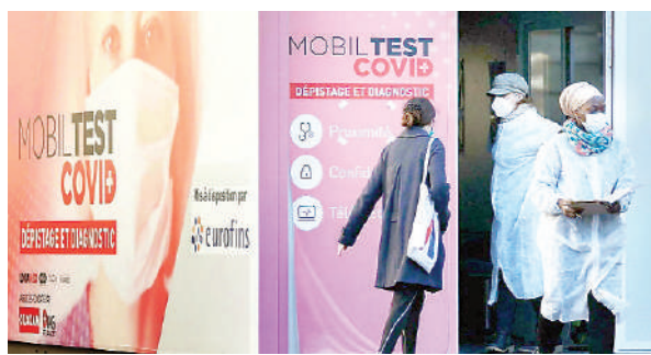
A COVID-19 testing site in Paris.

The change in rules should allow a "benefit-risk balance aimed at ensuring the virus is controlled while maintaining socio-economic life", the French health ministry said.