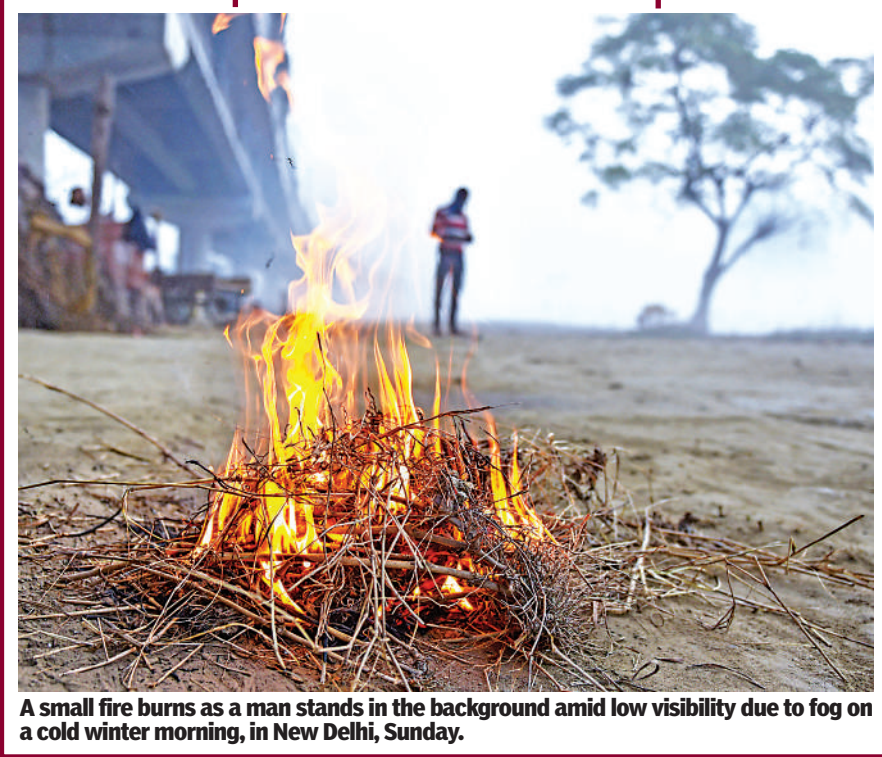
A small fire burns as a man stands in the background amid low visibility due to fog on a cold winter morning, in New Delhi, Sunday.