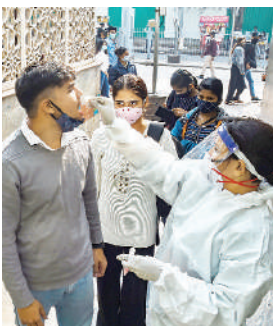
A health worker conducts COVID-19 testing of a man amid concern over a third wave of the coronavirus pandemic in India, in New Delhi, Sunday.

Under the Graded Response Action Plan or GRAP - approved in July by the Delhi Disaster Management Authority - if the positivity rate is over five per cent for two consecutive days a 'Red' alert can be sounded. This would lead to "total curfew" and halting of most economic activities. Today's figure is the