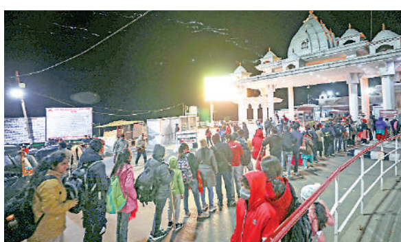
Devotees stand in queue outside Darshani deodi while on their way to Mata Vaishno Devi shrine, in Reasi district, Sunday morning.

Trikuta hills in Reasi district, about 50 km from Jammu. As we entered the sanctum sanctorum of the