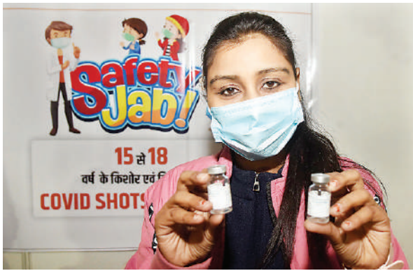
A health worker shows Covaxin vial during preparation for 15-18 age group vaccination drive, in Patna.

The vaccine option for those in the 15-18 age group would only be Covaxin, according to a set of new guidelines issued by the Union health ministry. Besides