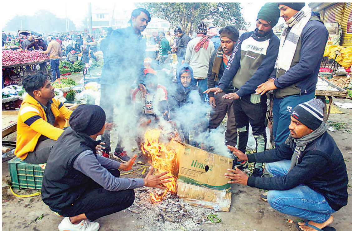
People sit around a small fire to warm themselves on a cold winter morning, at a wholesale vegetable market in Gurugram, Sunday.