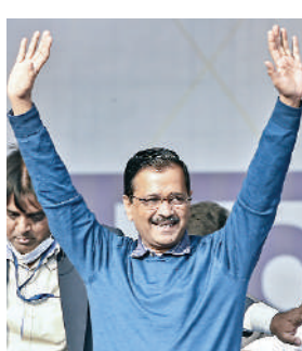
Delhi Chief Minister Arvind Kejriwal waves towards supporters during Kejriwal Ki Maharally in Lucknow, Sunday.

"Active COVID-19 cases rose from about 2,000 on December 29, 2021 to 6,000