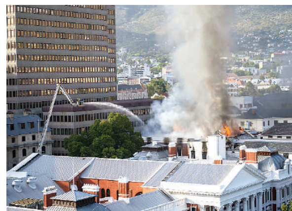
Firemen spray water on flames erupting from a building at Parliament in Cape Town.