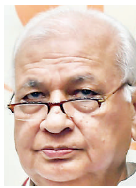
Arif Mohammed Khan

Terming as "irresponsible" and "ignorant" the statements that he had recommended conferring of Kerala University's honorary D.Litt on President Ram Nath Kovind, Governor Arif Mohammed Khan on Sunday said he was seeing a "disturbing trend" which impinges the national institutions, dignity and prestige.