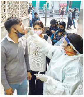
A health worker conducts COVID-19 testing of a man amid concern over a third wave of the coronavirus pandemic in India, in New Delhi, Sunday.

Delhi logged 3,194 new coronavirus cases over the last 24 hours, 15 per cent higher than Saturday. One person has died, taking the total number of fatalities since the beginning to pandemic to 25,109. The city logged 2,176 cases on New Year's day - a 50 per cent spike. The positivity rate rose to 4.59 per cent, according to data from the city's health department. Under the Graded Response Action Plan or GRAP - approved in July by the Delhi Disaster Management Authority - if the positivity rate is over five per cent for two consecutive days a 'Red' alert can be sounded. This would lead to "total curfew" and halting of most economic activities. Today's figure is the