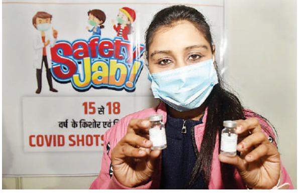
A health worker shows Covaxin vial during preparation for 15-18 age group vaccination drive, in Patna.

Union Health Minister Mansukh Mandaviya on Sunday said states and union territories should take necessary measures, including setting up separate vaccination centres, to avoid mixing-up of Covid vaccines during administration of shots to those in the 15-18 age group. Inoculation of children in this age category will start on January 3. The vaccine option for those in the 15-18 age group would only be Covaxin, according to a set of new guidelines issued by the Union health ministry. Besides