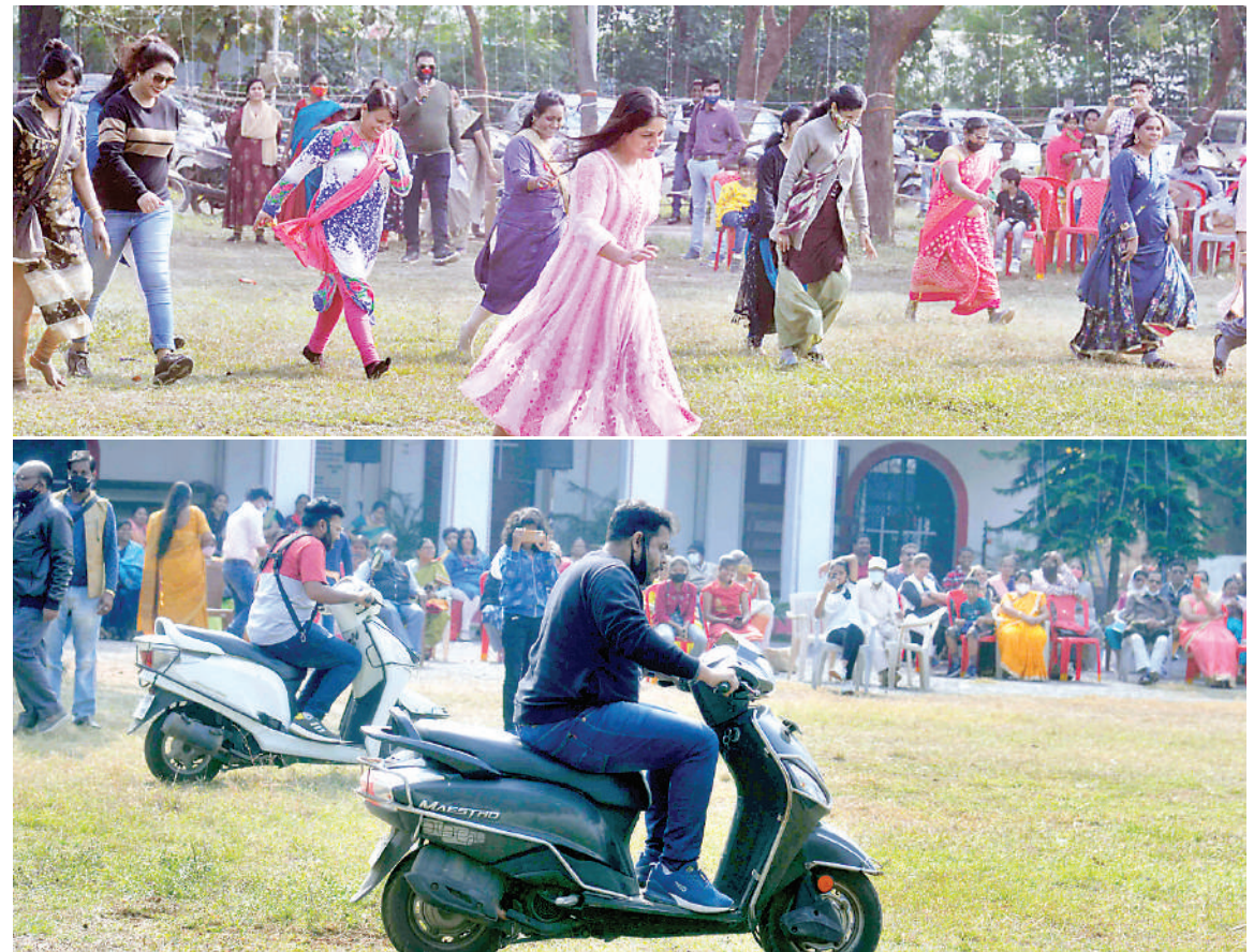
On first Sunday of the New Year, many families and groups went for outing to gardens and enjoyed family get-together.