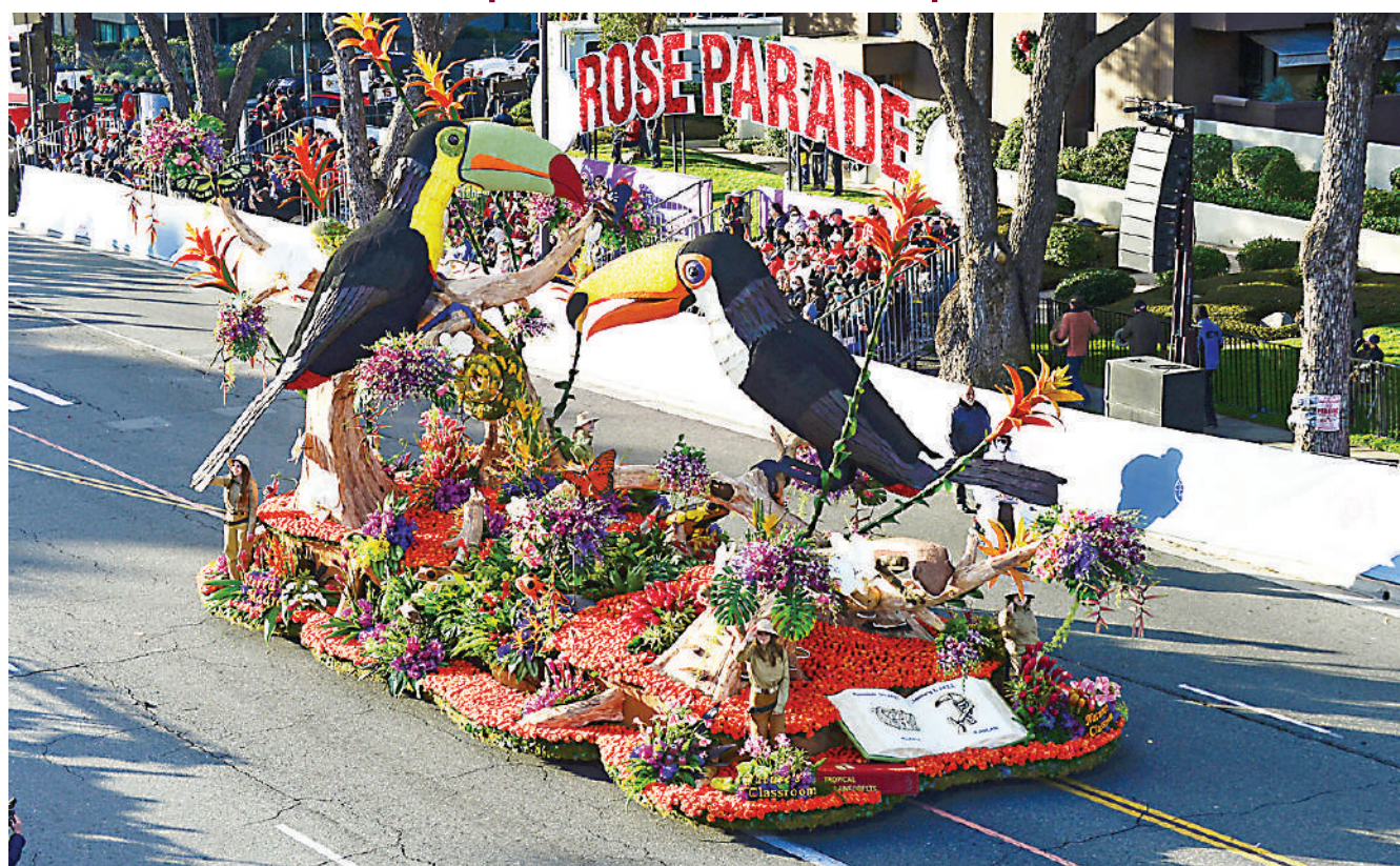
The Sierra Madre Rose Float Association, 'Nature's Classroom,' float in the 133rd Rose Parade Presented in Pasadena, California, US.