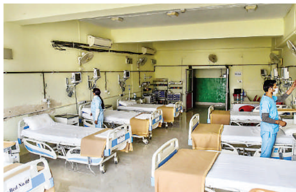
Health workers check monitoring devices inside a COVID-19 isolation ward to treat patients infected with the Omicron variant, at Patliputra Sport Complex in Patna, Sunday.

The notion that Omicron is a natural vaccine is a "dangerous idea" spread by irresponsible people who don't take into account "long COVID" about which very little is understood, experts have said. The Omicron variant of COVID-19, which is said to be much more infectious than the other variants, is, however, causing milder infections, less hospitalisation and deaths which is leading to the notion that it can act as a natural vaccine. Recently, a Maharashtra health official also claimed that Omicron will act as a natural vaccine and may help in COVID-19's progression towards the endemic stage.