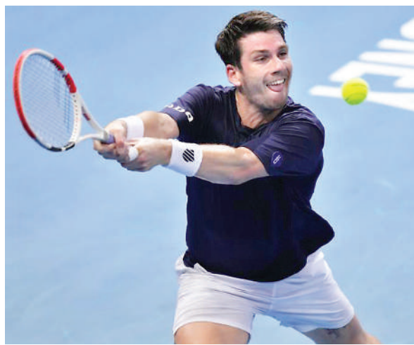
Britain's Cameron Norrie hits a backhand to Germany's Alexander Zverev during their match at the ATP Cup tennis tournament in Sydney, Sunday.