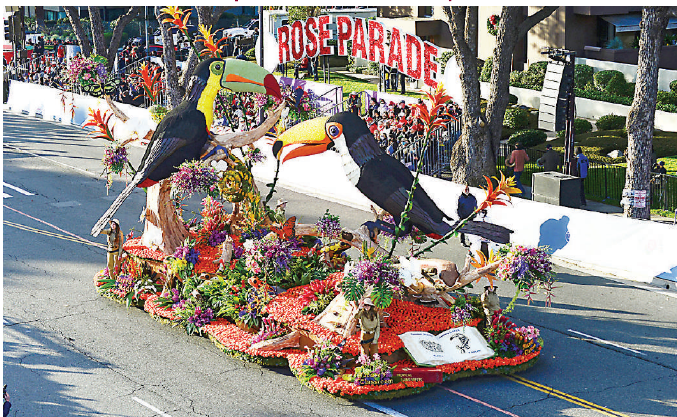
The Sierra Madre Rose Float Association, 'Nature's Classroom,' float in the 133rd Rose Parade Presented in Pasadena, California, US.