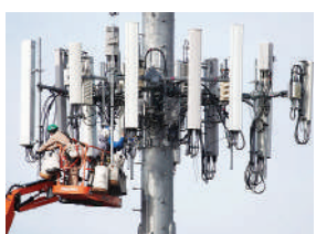
A 5G telephone tower in US.