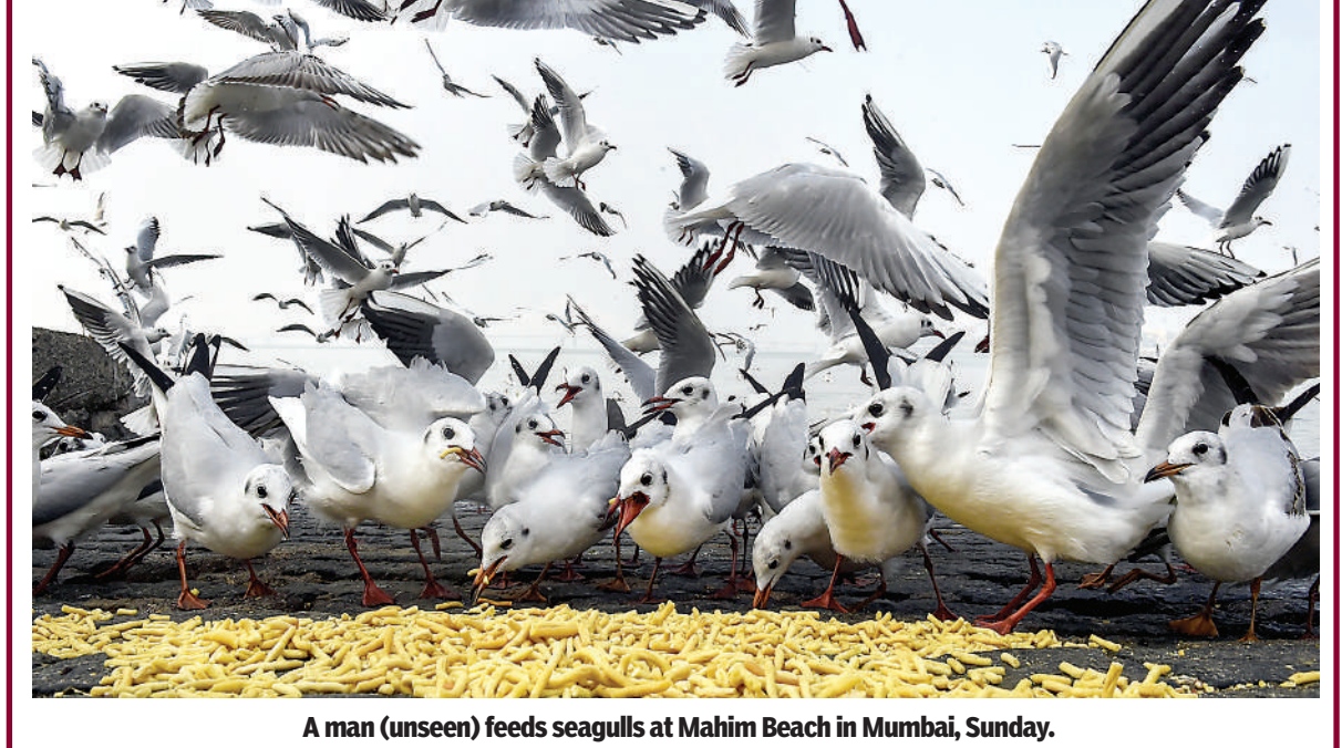
A man (unseen) feeds seagulls at Mahim Beach in Mumbai, Sunday.