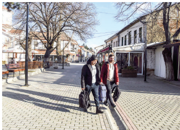
Students walking in a street of the North Macedonian town of Valandovo.