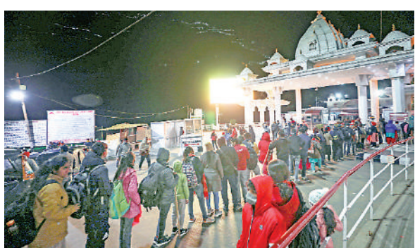
Devotees stand in queue outside Darshani deodi while on their way to Mata Vaishno Devi shrine, in Reasi district, Sunday morning.

Trikuta hills in Reasi district, about 50 km from Jammu. As we entered the sanctum sanctorum of the