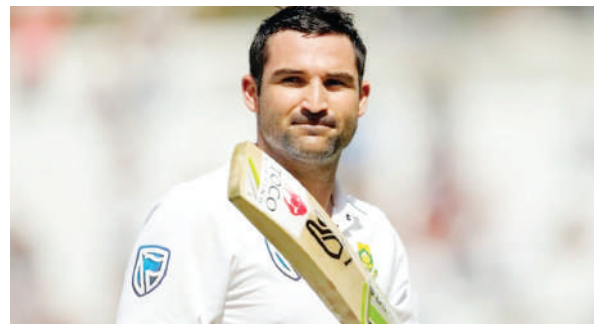
South Africa skipper Dean Elgar.

"Players respect the environment. We realise that we had a few setbacks in recent times and we need to obviously have to be